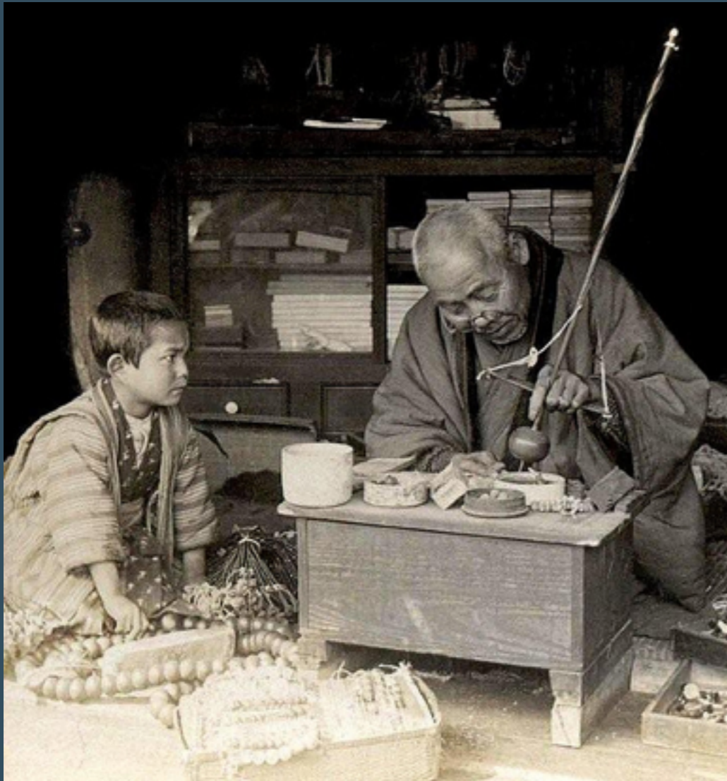
THE BEAD MAKER -- Apprentice Watches the Master -- A Rosary Shop in Old Meiji-Era Japan

https://www.flickr.com/photos/okinawa-soba/2585609947/